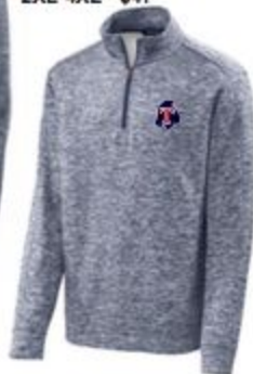
TMS17-17 ELECTRIC HEATHER NAVY PERFORMANCE 1/4 ZIP Embroidered Logo ADULT SIZES ONLY (Adult XS similar to Youth Lg) Adult XS - XLG - $45 2XL-4XL - $47