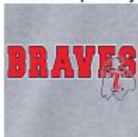
TMS17-1 - Sport Grey