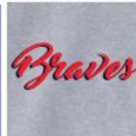
TMS17-4 - SPORT GREY