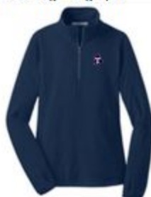
TMSF17-18 - Ladies Navy Embroidered Logo 1/4 Zip Micro Fleece Sizes: Ladies XS-XLG- $45 Sizes: 2xlg - 4xlg - $47