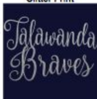
TMS17-8 - RED Glitter Print