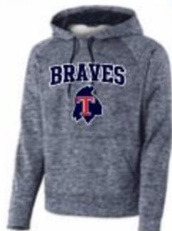
TMS17-16 ELECTRIC HEATHER NAVY PERFORMANCE HOODIE Yth XS-Yth XL; Adult Sm-XL-$40 Sizes 2xlg - 4xlg $42