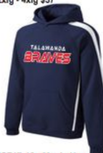
TMS17-14 NAVY/WHITE Sleeve Stripe 9oz. HOODIE Yth XS-Yth XL; Adult Sm-XL-$35 Sizes 2xlg - 4xlg $37