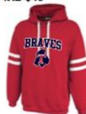
TMS17-15 Football Style Red 9.5 oz. Hoodie ADULT SIZES ONLY (Adult XS similar to Yth Lg) Adult XS-XLG-$40 2XL-4XL-$43