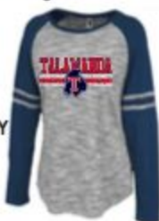
TMSF17-13 - Ladies Long Sleeve Fan Shirt Sizes: Ladies XS-XLG- $28 Sizes: 2xlg- $30