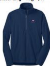
TMSF17-18 - Men's Navy Embroidered Logo 1/4 Zip Micro Fleece Sizes: Ladies XS-XLG- $45 Sizes: 2xlg - 4xlg - $47