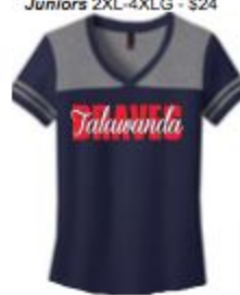
TMS17-11 Juniors Varsity V-Neck NAVY/HEATHER GREY *ITEM RUNS SMALL, PLEASE ORDER 1 SIZE LARGER THAN NORMAL. Juniors XSM-XLG - $22 Juniors 2XL-4XLG - $24